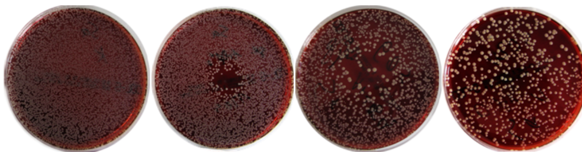
Figure 1: From left to right, examples of agar plates with grown colonies of Staphylococcus aureus : untreated control, very centred inhibition zone (Ar + 0.1% O 2 , 120 s exposure time in closed system, spatial-intermediate inhibition (Ar + 0.5% O 2 , 60 s exposure time in open system), un-centric overall reduction (Ar + 1% O 2 , 120 s exposure time in open system).